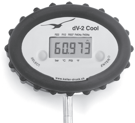
dV-2 Cool with rubber protection